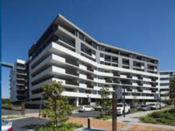
One The Waterfront Wentworth Point