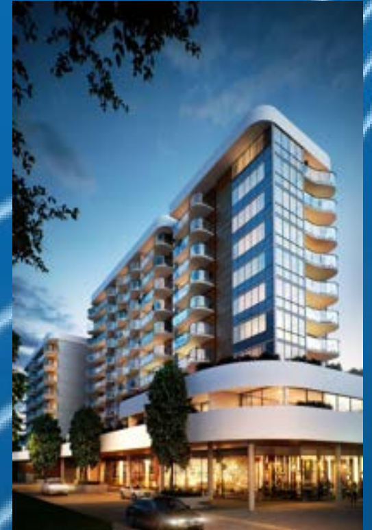
Carnegie 1060 Melbourne